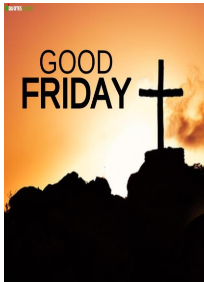
GOOD FRIDAY SERVICE 7:30PM April 7