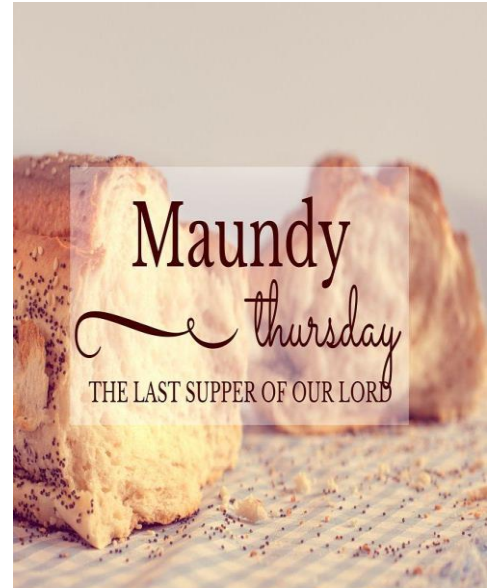
12:00 NOON and 7:30PM April 6