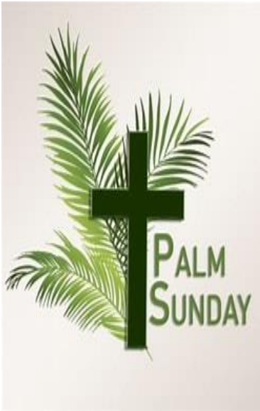
PALM SUNDAY 9:00 AM April 2